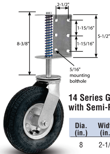
14 Series Gate Caster with Semi-Pneumatic Tire (27 Radial Ball Bearing)