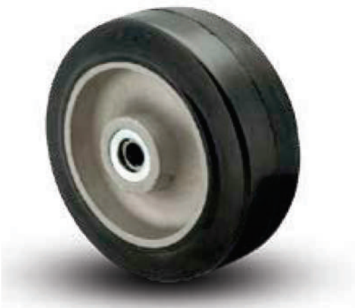
MOLDON RUBBER/ALUMINUM CORE