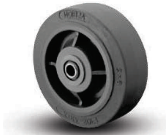
SOFT RUBBER/POLYPROPYLENE CORE