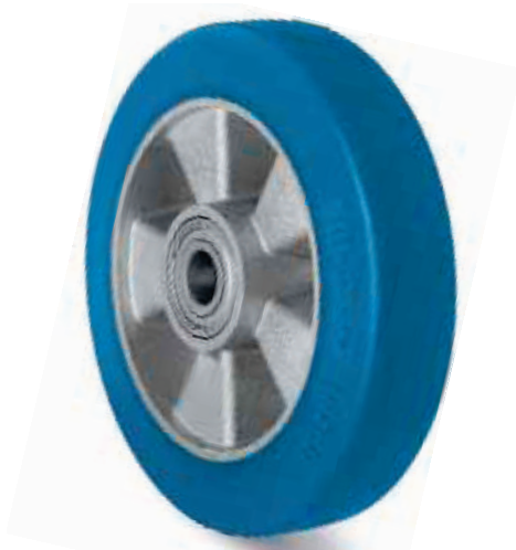
ELASTIC RUBBER ALUMINUM