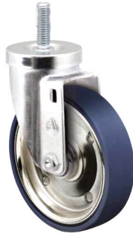
SERIES J 2JPW5STS5 THREADED STEM