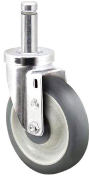
SERIES J 2JPG5SGS5 GRIP STEM