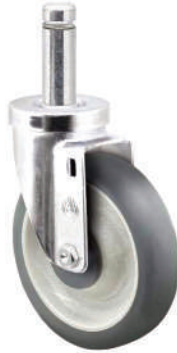
SERIES J 2JPG5SGS5 GRIP STEM