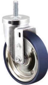
SERIES J 2JPW5STS5 THREADED STEM