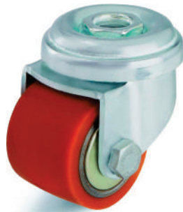
Hole Swivel Caster