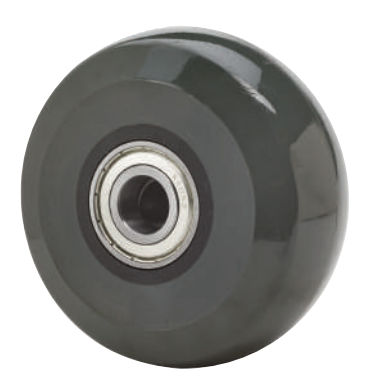
(SEN) Solid Elastomer Wheel with pre-loaded sealed precision ball bearings

SEN Solid Elastomer Wheels have super strength solid cast polyurethane elastomer one piece design with mechanically locked glass filled nylon bearing core, offers the best durability and performance of any elastomer type wheel on the market.