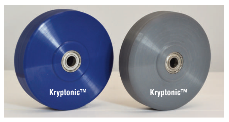
(KR) Blue Kryptonic™ Straight Sided Wheel w/Precision Ball Bearings