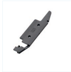
Front wear plate