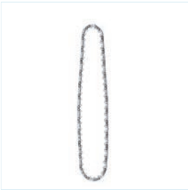
Saw chain 165