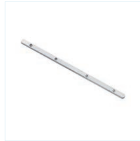
Connector piece for guide rails