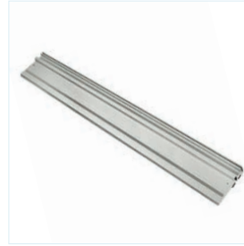
Guide rails 1400 mm