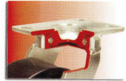
Swivel Head Section