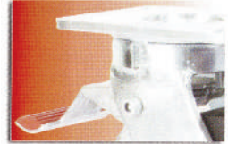
Total Lock System