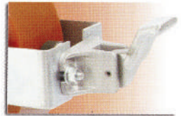
Wheel Face Brake