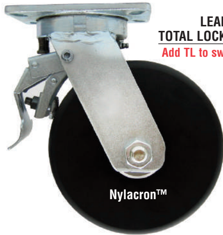
LEADING SIDE TOTAL LOCK SWIVEL CASTER Add TL to swivel caster number