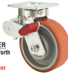
NEW TRAILING SIDE TOTAL LOCK SWIVEL CASTER No need to move cots back and forth for finding the brake pedal. Add TLN to swivel caster number