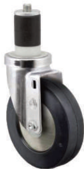
2JSSP05SES9 Stainless Steel Expanded Stem