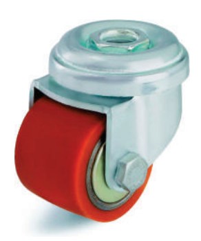
Hole Swivel Caster