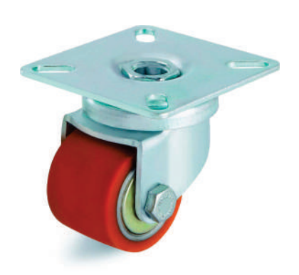
Plate Swivel Caster