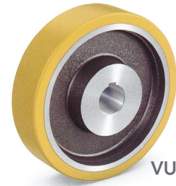
VU H7 SERIES

VULKOLLAN® drive wheels Gray cast iron wheel center with bore and keyway according to DIN 6885. Direct bonded VULKOLLAN® tread (93° Shore A).