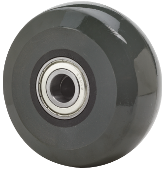
(SEN) Solid Elastomer Wheel with pre-loaded sealed precision ball bearings

SEN Solid Elastomer Wheels have super strength solid cast polyurethane elastomer one piece design with mechanically locked glass filled nylon bearing core, offers the best durability and performance of any elastomer type wheel on the market.