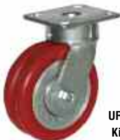
URD-SWE-820-CRN Wheels Kingpinless HD Caster Rig