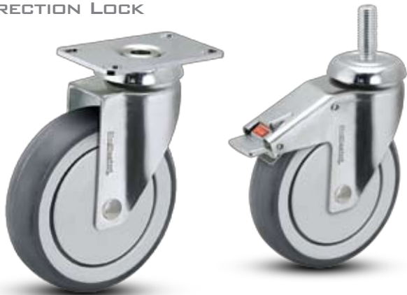
PLATE • HOLLOW RIVET • GRIP RING • THREADED • ROUND • SQUARE • SWIVEL TOTAL LOCK • DIRECTION LOCK