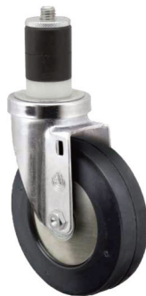
2JSSP05SES9 Stainless Steel Expanded Stem