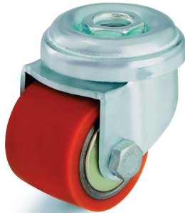
Hole Swivel Caster