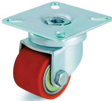
Plate Swivel Caster