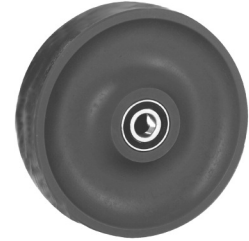
(KR/HT) Gray Kryptonitic™ Wheel w/ Precision Ball Bearing available in 5-1/4" size only