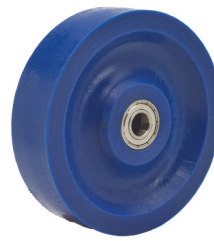
(KR) Blue Kryptonitic™ Wheel w/ Precision Ball Bearing