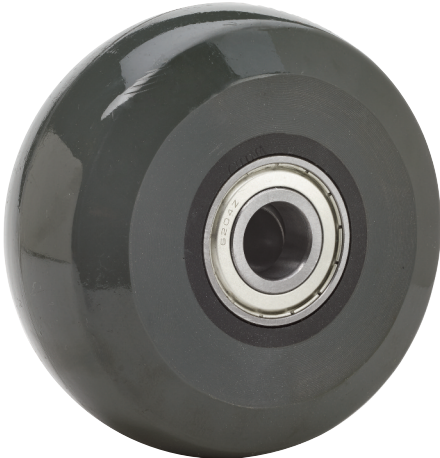
SOLID ELASTOMER/NYLON CORE